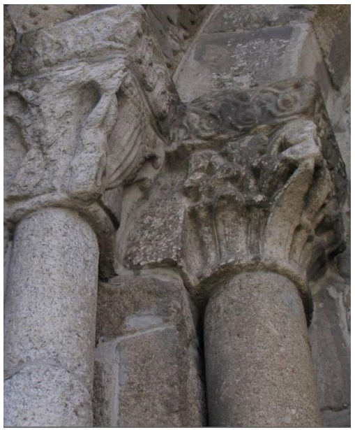
Figure 5. Image of two granite types on columns of a portal in a monument of Braga (NW Portugal): the darkish-brownish one on the right is similar to the local granite while the lighter one on the left is similar to certain facies from surrounding regions.

The built elements can also contribute to the teaching of relations between substrates and biological activity as is illustrated in Figure 4 where the development of biological colonization shows patterns associated with the type of substrate with lichens and moss on the stones and plants on the spaces between the stones.