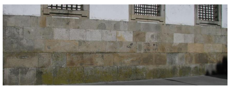
Figure 8. A wall with regular distribution of regular shaped stones (it is possible to define referencing for locating individual stones and individual features inside a given stone).

Regular walls (as in Figure 8 ) that show diverse types of granitic rocks) made of regular geometrically stones can be also object of precise referencing (due to the geometrical conditions). The wall can be locate by GPS coordinates (or, in this case, by a building plan), and the regular pattern allows to locate each individual stone in the wall (by indicating the line number from upper or lower one and the stone number in that line from either right or left or south or north). The geometry of the stone faces (rectangles) allows locations of smaller FGIs within each stone by using horizontal and vertical distances from reference points (e.g. upper left corner). In this way it is possible to "digitize" the geological features of the wall stones.