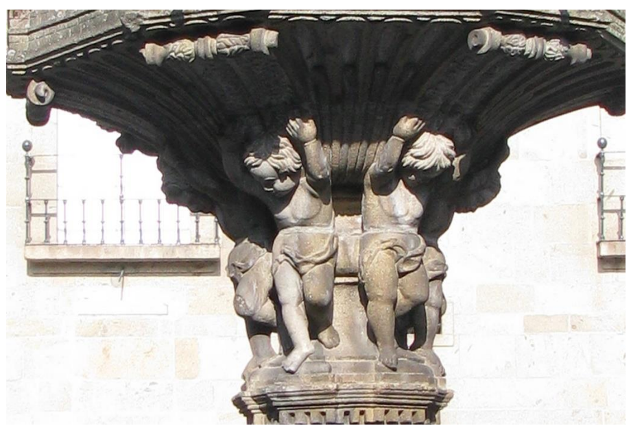
Figure 6. Image from a granite fountain (location of specific details will be an excruciating challenge).