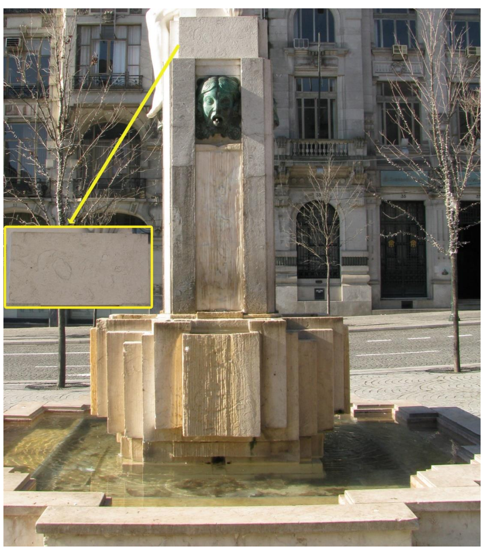
Figure 7. View of the east side of the pedestal of the Youth statue in Porto (NW Portugal – a town located on granite terrains) with inset showing the fossils.