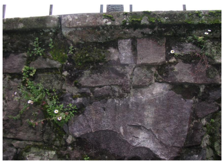
Figure 4. Illustrative image of relations between substrate and biological colonization with lichens and moss on the stones and plants in the joints between the wall stones.