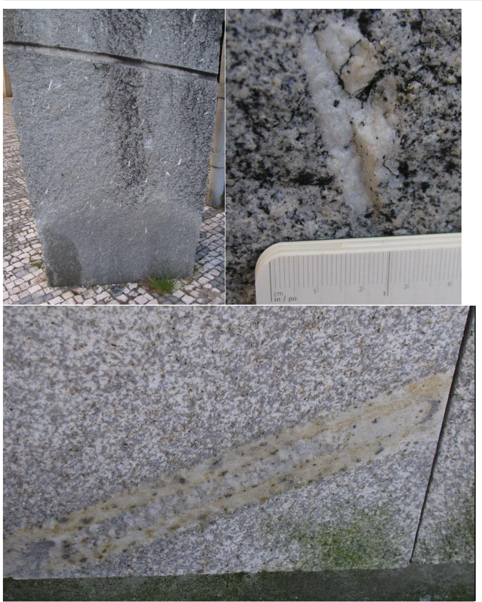
Figure 2. Examples of features of geological interest (FGIs) in built environment: biotitic porphyric granite (upper left hand); twinning on feldspar (upper right hand); aplite-pegmatite textures in a veinlet of a two-mica granite (lower image).

information on those FGIs. In the second perspective (more suited for a more historical and architectural orientated public), the built heritage elements are the objects and the geological materials are seen as informations of these objects.