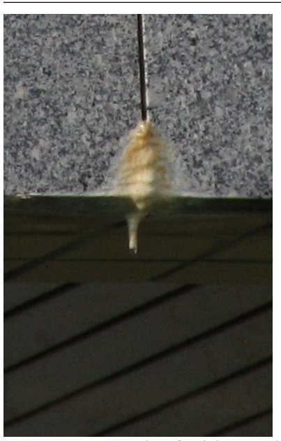
Figure 3. Example of calcium carbonate neoformation with stalactite-like structure on a granite slab (if you look closely you might be able to see on the lower tip of the "stalactite" a drop of the solutions that are forming it).

can also be used to show geologic substances (and their features) not available locally, e.g. carbonate rocks on granite locations (as will be illustrated in the next section).