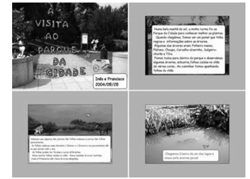
Picture 3 – Writing about a visit to the city park, from Escola da Vilarinha, Porto

The fulfilment of a scientific project demands an expressive and dynamic involvement, a rigorous process analysis, information systematization, as well as proceedings to mobilize theoretical knowledge well established, by its agents. From the beginning, a continuous evaluation attitude was assumed in order to unchain the reflection and analysis processes about the reality.