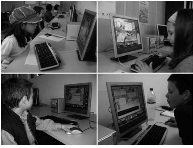
Picture 2 – Family Group at Coimbra, trying the synchronous collaborative features

We found in first session that we have a competitive group, a collaborative group and a cooperative group.